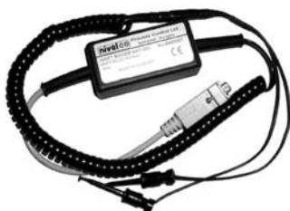
HART MODEM SAT-304