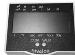
DISPLAY MODULE SAP-202